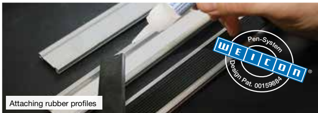
Attaching rubber profiles

WEICON Contact is a solvent-free instant adhesive. It bonds various materials, such as metal, glass, wood, plastic, ceramic, leather and rubber, to and among each other in seconds.