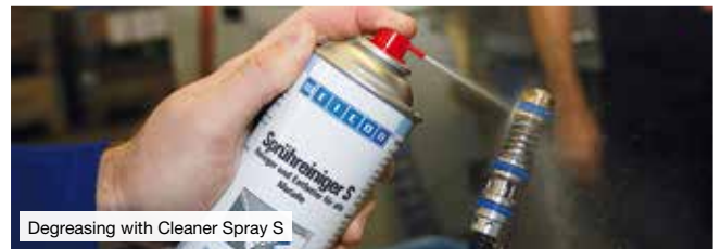
Degreasing with Cleaner Spray S

They care for and protect surfaces when cleaning, degreasing, dissolving and separating and are an indispensable part of everyday work.