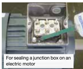
For sealing a junction box on an electric motor