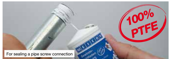
For sealing a pipe screw connection

WEICON DF 175 is a patented thread sealing cord made of 100% PTFE. It permanently and securely seals almost all metal and plastic threads. WEICON DF 175 reliably compensates the space on threads and forms a PTFE film in the necessary thickness when connecting screws.