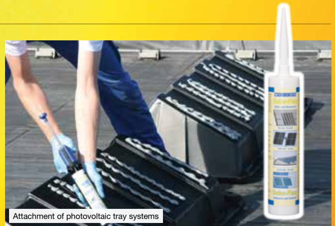
Attachment of photovoltaic tray systems