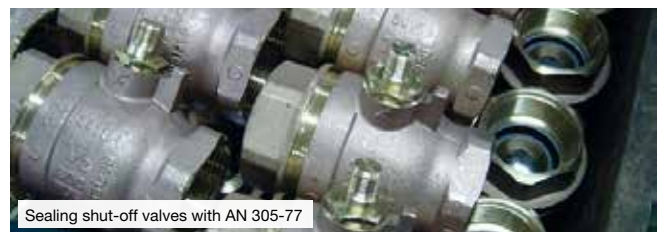
Sealing shut-off valves with AN 305-77

A vibration and impact resistant adhesive bond is created after curing, which is resistant to chemicals, solvents and temperatures of -60°C to +150°C.