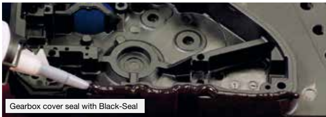
Gearbox cover seal with Black-Seal

Elastic adhesives and sealants are now used in many areas of industrial production and assembly. They combine the advantages of the adhesive and sealant technology and are used everywhere where high demands are placed on the elasticity and sealing effect of a joint.