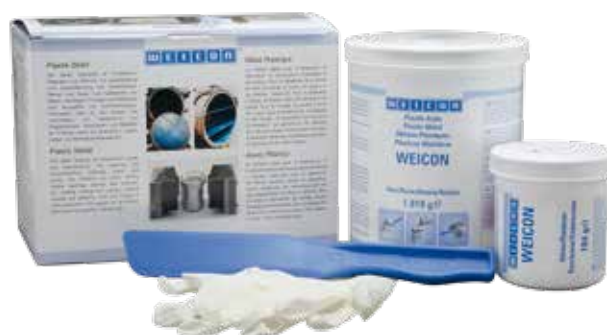
Fast pipe repairs with WEICON SF